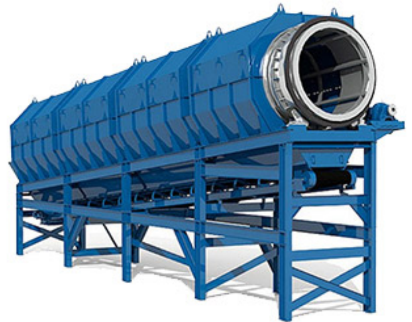
Rotatry Trommel Screen